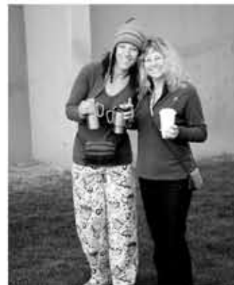
You can just be yourself on Cycle Oregon.