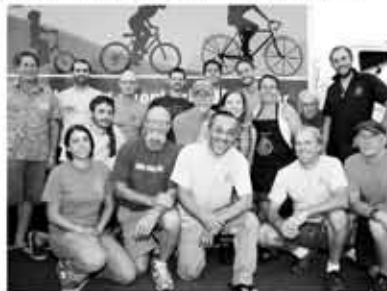
The CCC crew, taking a break from making bikes look great.