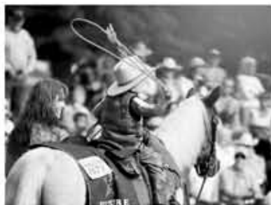
This little guy had some serious crowd-pleasing skills and charm.