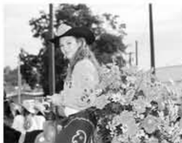
The pageantry of the Westward Ho! Parade.