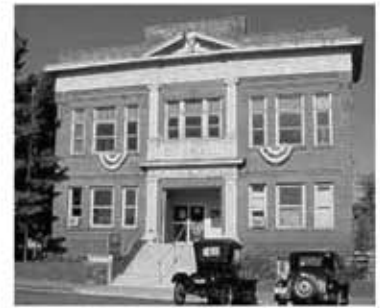
Hey, weren't we just here a week ago? Seems longer somehow.

To start off: This is a long day; start early and don't tarry. The route enters the Umatilla Indian Reservation just as we leave Pendleton. Some of the road follows the Umatilla River, and we cross the river after the second stop of the day, passing by a tribal fish hatchery at the bottom of the first hill of the day. Lunch is in the community of Weston. The area around Weston and Athena was once called the "pea capital of the world" because of the amount of peas harvested and processed in the area. After lunch, the route leaves ranch and farm land and begins an ascent into the Blue Mountains. We travel through a forest comprised of fir, pine and tamarack, and pass by a few