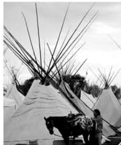
The Round-Up celebrates Native American culture as well.