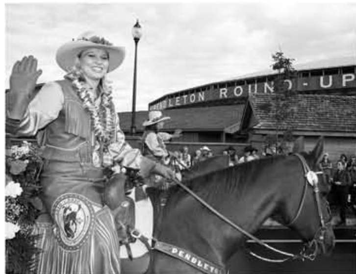
Rodeo queens, gleaming horses and the Round-Up arena.