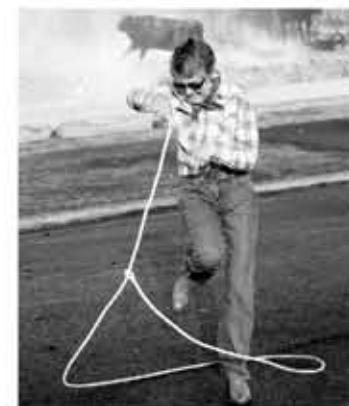
"I want to learn to rope and ride."